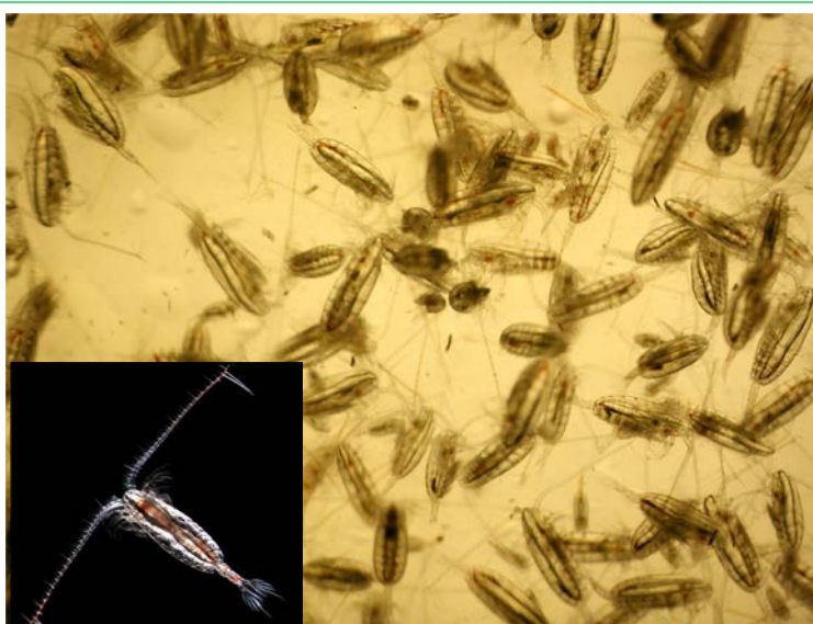
Copepods are a large and diverse group of small (1 to 2 millimeters) crustacean species, found in aquatic environments. (Photograph shows Calanus marshallae )

Tracking copepods in the northern California Current provides information about changes that can impact the marine food chain. Although waters originating from the north contain fewer copepod species, these organisms are high in fat content and appear to be essential for many fishes to grow and survive the winter. The southern copepod species are generally smaller, with low fat reserves and less nutritional value. Poor feeding conditions for the small fish that are prey for juvenile salmon during the recent marine heat wave described above led to dramatic declines in salmon populations. Copepod species richness has proven to be a useful predictor for salmon abundance and has also been linked with seabird nesting success in central California.