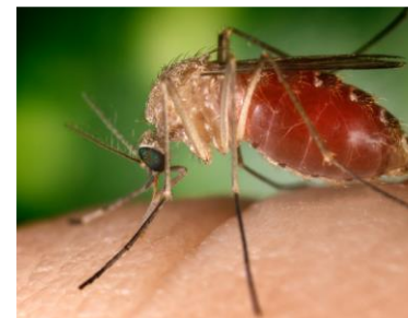
West Nile Virus mosquito

Humans infected with West Nile Virus and other vector-borne diseases can potentially suffer serious health consequences. Neuroinvasive cases of WNV, although rare, can result in encephalitis or meningitis. Another mosquito-borne virus that can cause severe illness in California is the St. Louis encephalitis virus (SLEV). SLEV re-emerged in 2015 after over a decade without detection. SLEV outbreaks have long been associated with elevated temperatures. Climate change is likely to also impact the transmission of tick-borne diseases in California, the most common being Lyme disease.