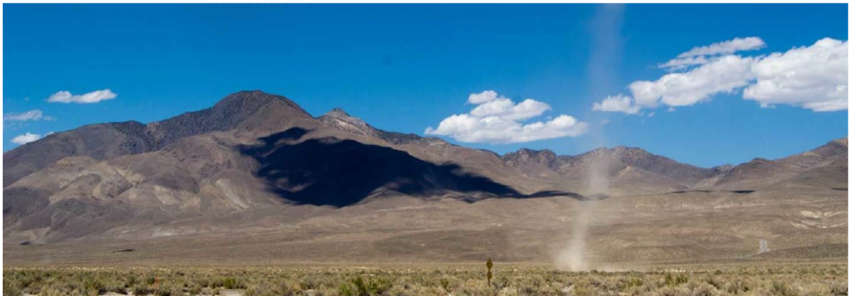
Figure 8. "Dust Devil" as seen from Route 168, heading east towards the White Mountains and Westgard (east of Big Pine)

Drought conditions have become commonplace over the past twenty years; the region is a Great Basin High Desert climate, so there is not an abundance of water during the year, but over the past ten years it has become more noticeable that the amount of rainfall and snowfall has significantly decreased.