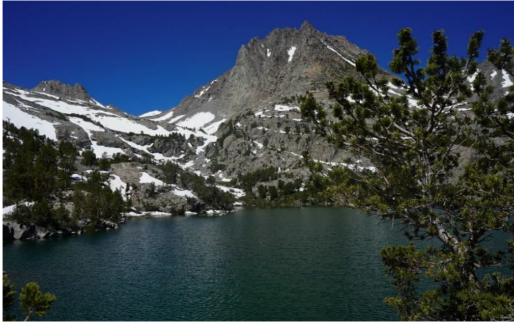
Figure 9. Alpine Lake within the Eastern Sierras, at the Palisades (west of Big Pine and part of the Big Pine watershed)

such as mosquitos and wasps coming out of hibernation earlier in the year. These insects would normally die off during the cold winter but now they persist.