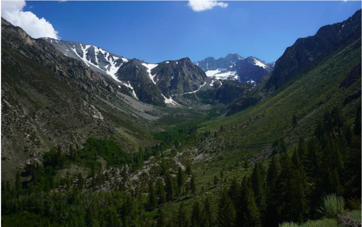
Figure 3. The Eastern Sierras route to the Palisades, part of the Big Pine traditional territory.

When the land that is now known as the Big Pine Reservation was originally set aside for Native Americans in the 1930s, it was originally designated as a Rancheria, which designated the land to be used as small homesteads for the people who were admitted to live upon it. In the 1970s, the Rancheria was converted into a reservation, which permitted more home building upon the land and agricultural practices became reduced.