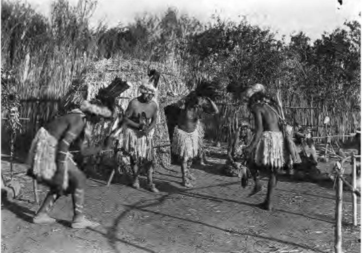
Figure 7. Paiute men dressed and performing war dance

The burial sites of the Big Pine Nümü located throughout the territory have often been desecrated and their locations are no longer shared with outsiders. Burial was not done by water and usually in locations that were not common to visit, so as not to disrupt them.