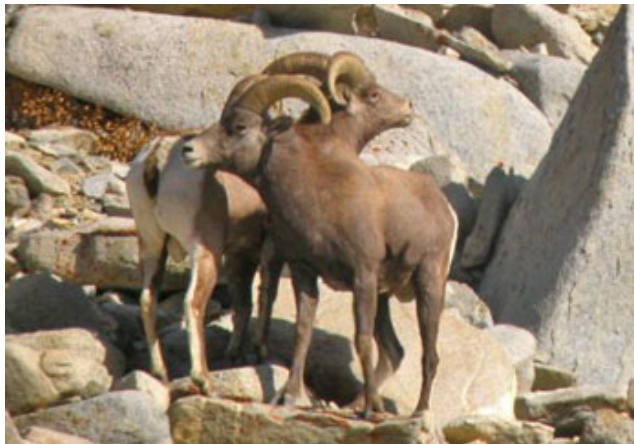
Figure 10. Bighorn Sheep

Native fish species are on the endangered species list due to introduction of other fish species, destruction of habitat, and lack of water, the impacts of which are exacerbated by climate change. Fish can be very delicate to care for, as even small fluctuations in temperature and sunlight can negatively affect their health. Reestablishing the native fish populations has been a struggle due to the change in the landscape and the lowering of the water table throughout the valley. If more is not done to protect them, there is a likelihood that species such as the Tui Chub and Owens Valley Pupfish will go extinct in the next decade. The Big Pine Peoples have focused all their attention to preserving the native fish and no longer fish for them.