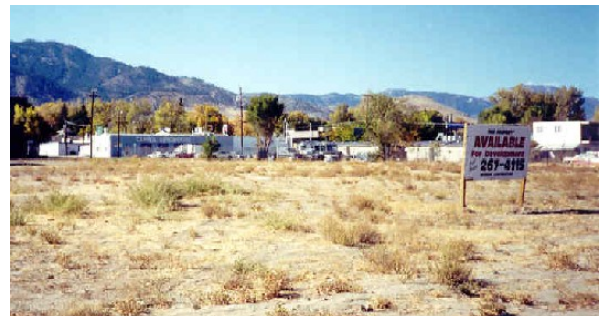
Undeveloped land that is zoned for a particular LUC, such as this empty plot (above) zoned as neighboring retail, needs to be included when calculating the current level of imperviousness.