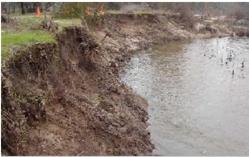
Typical incision in an urban creek caused by faster flows and greater volume of storm-water associated with impervious cover.

Impervious Cover (IC): All hard surfaces that permit little or no water to penetrate into the soil, such as rooftops, driveways, streets, swimming pools and patios.