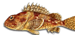
California Scorpionfish (Sculpin)