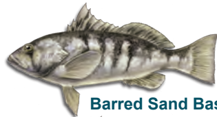
Barred Sand Bass