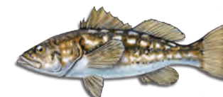
Kelp Bass (Calico Bass)