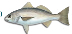
White Croaker (Kingfish or Tomcod)