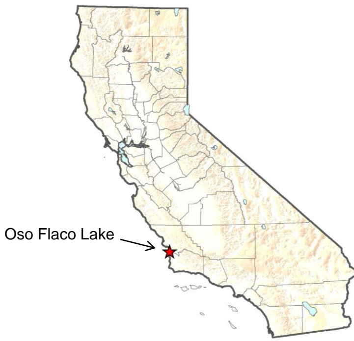
FIGURE 1. MAP SHOWING LOCATION OF OSO FLACO LAKE IN CALIFORNIA

The finding of chemicals in fish tissues from Oso Flaco Lake prompted the Office of Environmental Health Hazard Assessment (OEHHA) to develop this advisory report. The basic OEHHA process to develop consumption advice involves these steps: