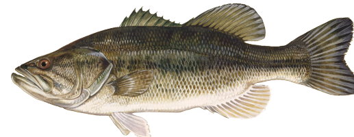
Black Bass Species