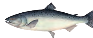
Chinook (King) Salmon ♥ high in omega-3s