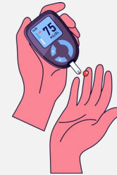
People with health problems