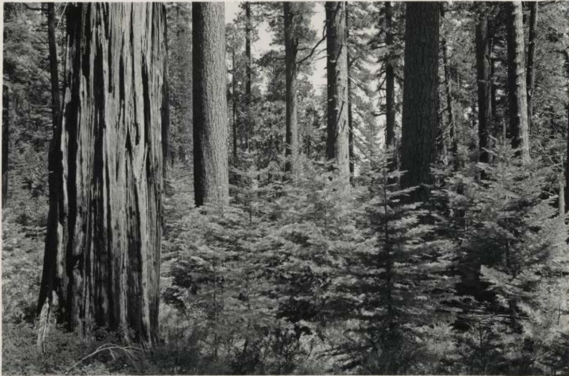
Old growth stands of sugar pine and white fir with Ponderosa pine and incense cedar near Yosemite National Park entrance, Big Oak Flat Road, taken June 1941.

Although also influenced by other factors, changes to the structure and composition of the state's forests and woodlands are a response to warming and drying conditions. Monitoring these changes provides valuable insight into future forest responses to climate change. There is evidence that wildfires, which are projected to increase in frequency and severity in the western United States, can accelerate these changes. At elevations up to about 5,000 feet, where pines and oaks grow together, wildfires have been shown to remove dominant conifers (including pines but also other needle-leafed trees), allowing resident oaks and chaparral to establish and become the dominant vegetation.