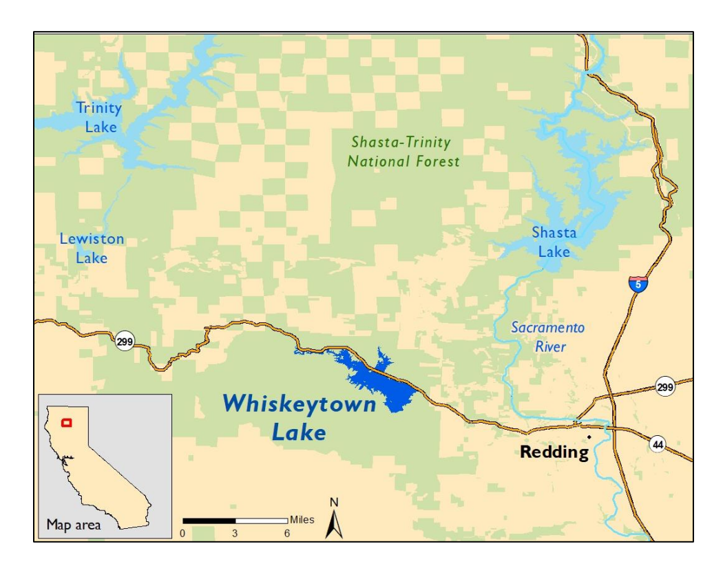
FIGURE 1. LOCATION OF WHISKEYTOWN LAKE

Whiskeytown Lake was formed in 1963 by construction of the Whiskeytown Dam, designed to divert water to the Sacramento River from the Trinity River Basin. The lake is positioned at the confluence of seven large streams, which collectively comprise a major watershed that drains into the Sacramento River, and provides drinking water for many municipalities. Whiskeytown Lake is approximately 3200 surface acres in size, with more than 36 miles of shoreline. Whiskeytown Dam is owned and operated by the U.S. Bureau of Reclamation, and the US National Park Service manages the Whiskeytown National Recreation Area, including Whiskeytown Lake.<sup>1</sup>