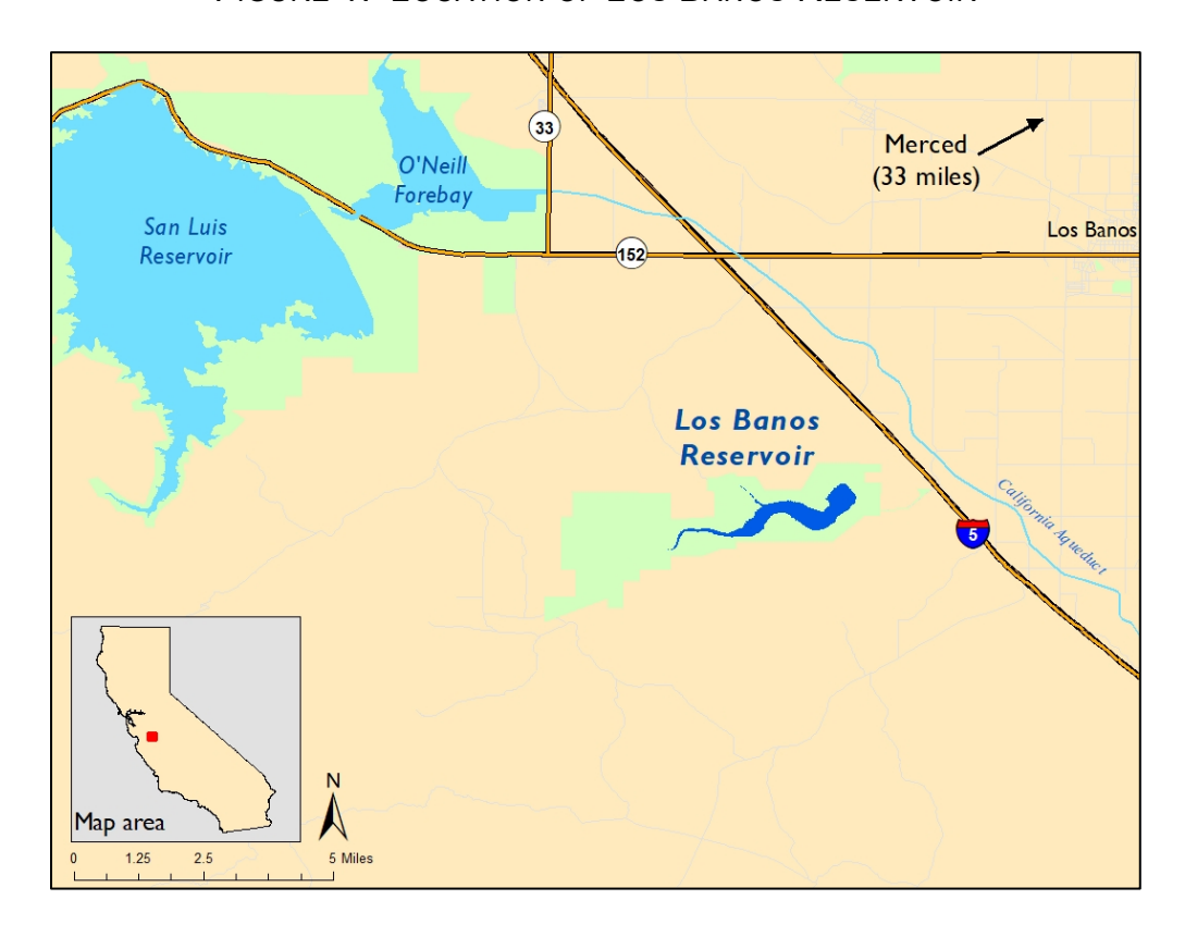
FIGURE 1. LOCATION OF LOS BANOS RESERVOIR

Los Banos Reservoir is located about 33 miles southwest of Merced, CA and was created in 1966 by the impoundment of Los Banos Creek by the Los Banos Detention Dam. Los Banos Reservoir has a storage capacity of 34,000 acre-feet and offers 12 miles of shoreline for recreational activities. The California Department of Water Resources maintains and operates the reservoir, which is owned by the US Bureau of Reclamation. The California Department of Fish and Wildlife plants trout in the fall and winter months.<sup>1</sup>