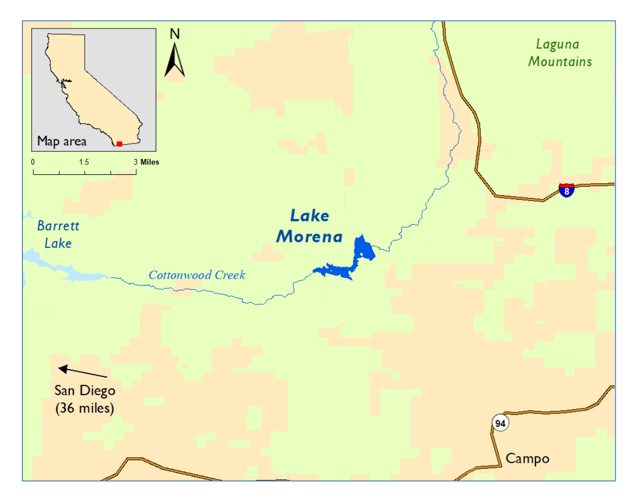
FIGURE 1. LOCATION OF LAKE MORENA

Lake Morena is located about 36 miles east of San Diego, CA. Lake Morena was formed in 1912 by the creation of Morena Dam on Cottonwood Creek, a tributary of the Tijuana River. Lake Morena, owned by the county of San Diego, serves as a reservoir to provide water to the city of San Diego.<sup>3</sup>