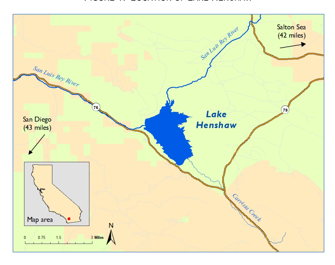
FIGURE 1. LOCATION OF LAKE HENSHAW

Lake Henshaw is located about 43 miles northeast of San Diego, CA, near the foot of Palomar Mountain. Lake Henshaw was formed in 1922 by the construction of Henshaw Dam on the San Luis Rey River.<sup>1</sup> The lake, which has a capacity of 51,832 acre-feet, is owned and managed for urban use by the Vista Irrigation District.<sup>2</sup>